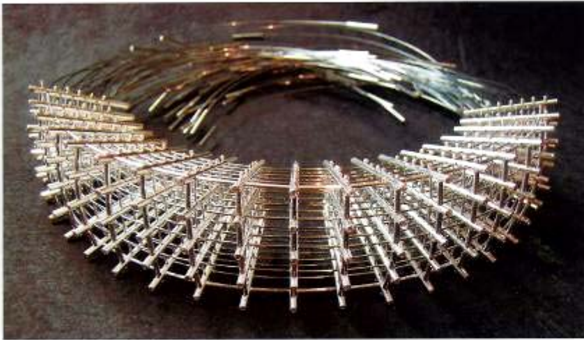
Neckpiece by Brenda Ridgwell, 2004, sterling silver, stainless steel, cubic zirconia, 230 x 60 mm