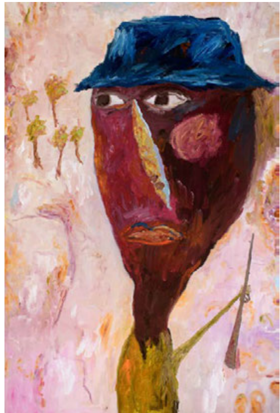
Ready and willing , 2019 Oil on Canvas 180cm x 120cm, $9,400