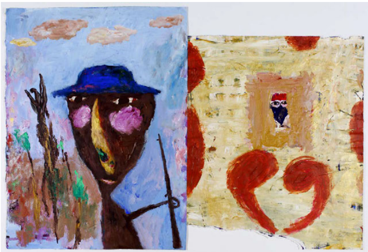
Seeking Captain Thunderbolt, 2019 Acrylic on rag paper, 100x104cm, $3000