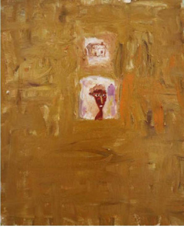
Looking for the Hideout , 2019 Oil on canvas, 51x61cm $1,400