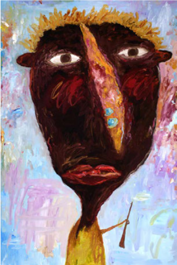
Now or never , 2019 Oil on Canvas, 180x120cm. $9,400