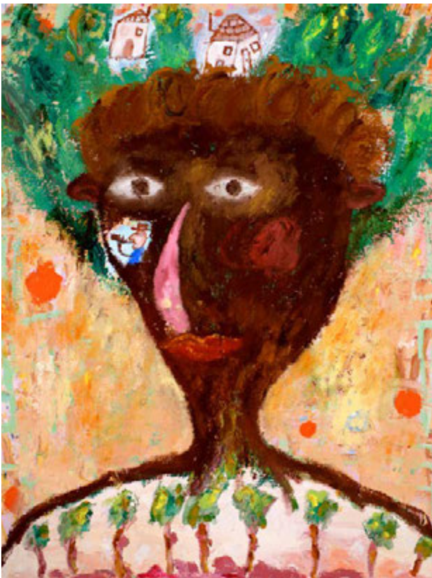
Out in the landscape , 2019 Oil on canvas, 150x120cm. $8,500