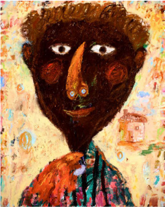
Man of many talents , 2019 Oil on Canvas, 150cm x 120cm. $8,500