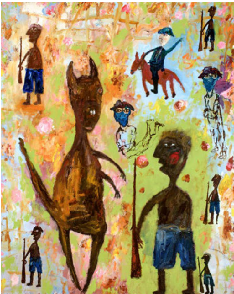
As we go around,, 2019 Oil on Canvas, 150 x 120cm. $8,500