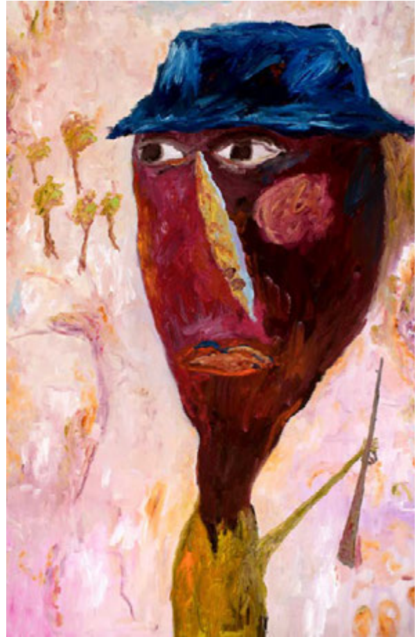
A long way from home , 2019 Oil on Canvas, 180x120cm. $9,400