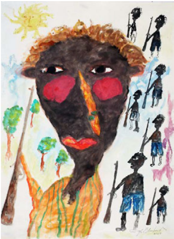
Search of Captain Thunderbolt , 2019 FLOW, National Contemporary Watercolour Prize, Watercolour on rag paper, $2,400