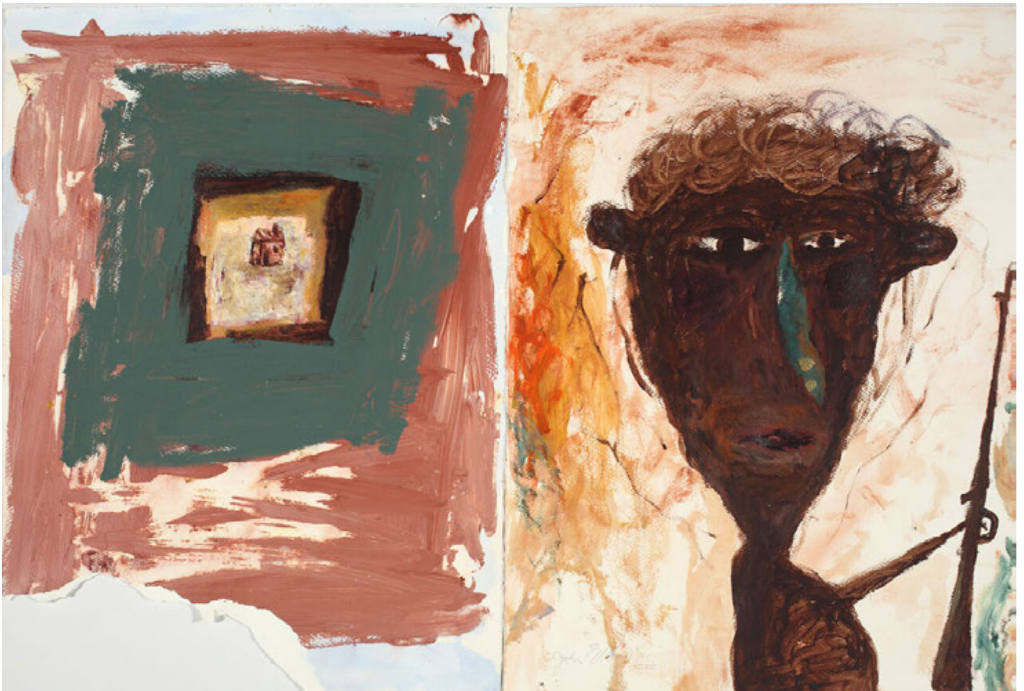
Aboriginal Tracker and the hide out, 2020 acrylic on rag paper, 100cmx135cm. $3000