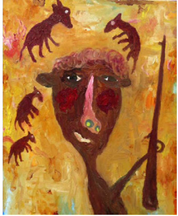
Writing is on the wall , 2019 Oil on Canvas, $1400