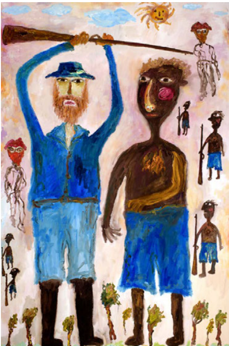
Together we shall overcome, 2019 Oil on Canvas, 180 x 120cm. $9,400