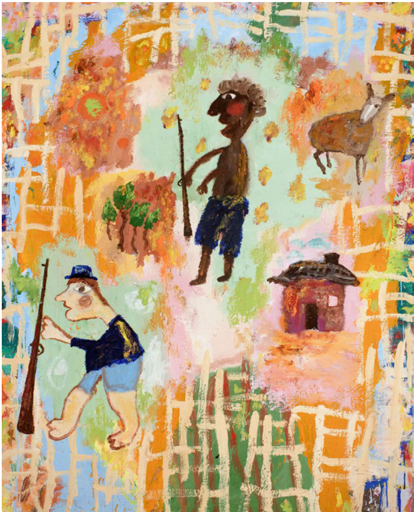
The hunt is on, 2019 Oil on Canvas, 150x120cm, $8,500