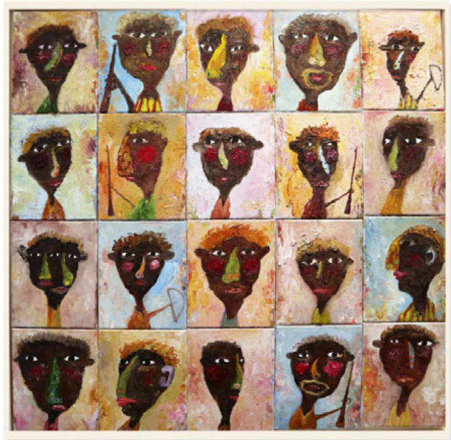
Aboriginal trackers and the Hideout, 2019 Oil on Canvas, $5000