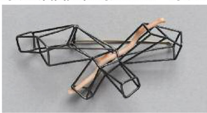
Carlier Makigawa, brooch, 2010, stg and oxidised silver, coral, 9.5 cm