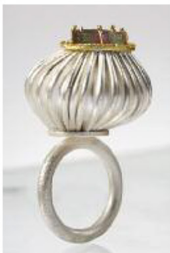
Felicity Peters, 'Japanese Chrysanthemum Multiculture', 2010, ring, stg silver, 18 ct gold, with tourmaline

ing 24 ct gold foil to the surface of fine silver. This produces a rich gold colour, while using very little of the precious metal. In Wave Bangle a wide band of gold encircles a waisted band of corrugated silver. Her work is linked to Erickson's in Japanese Chrysanthemum Ring , with a slice of coloured tourmaline captured in a gold setting.