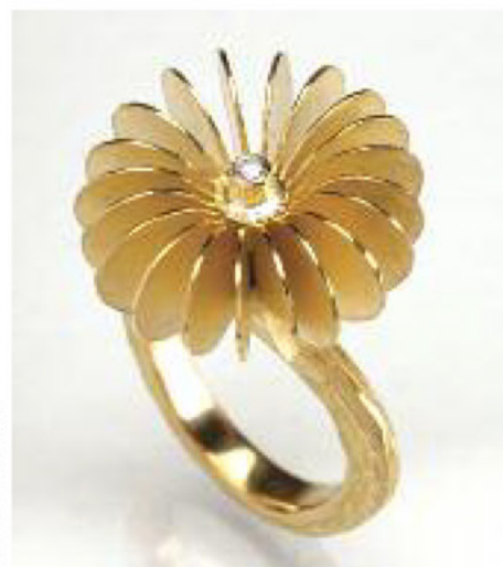
Gillian Rainer, ring, 2006, 18 ct gold, diamond, 3.2 x 2.2 x 2.2 cm