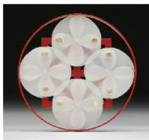
Christel van der Laan, 'Priceless II', 2006, brooch, 18 ct gold, silver, polypropylene price tags, diam. 6.3 cm