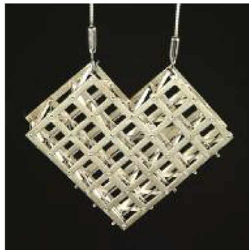
David Walker, 'Space Frame 15', pendant, stainless steel, powder coated stainless steel, 7.5 x 7.5 x 1.5 cm

ers. Makigawa's work is more fluid, with smaller sections making up brooches and bangles. Bright red fragments of highly polished coral captured in the interspaces of two brooches contrast with the matt surface of unpolished silver and the dark, matt surface of oxidised silver. The lacquer in Red Frame brooch delineates the apertures of three spaces, drawing our eye and urging us to consider how we might fill them. They might capture fleeting memories or reminiscences or they might just create spaces for us to segment and live our lives.