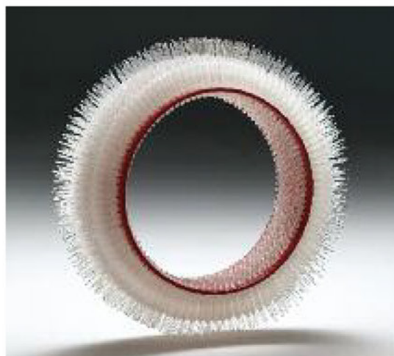
Christel van der Laan, 'Cut Price Red', 2011, bangle, painted silver, polypropylene price tag ends, diam. 11 x 3 cm

Dorothy Erickson, 'Kirche in Cassone - Homage to Klimt', brooch and bracelet, 18 ct gold, stg silver, multi-coloured sapphires, 3 x 3 x 0.5 cm