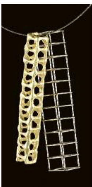
David Walker, 'Space Frame 1', pendant, stg silver, 8.5 x 1.5 x 1.5 cm